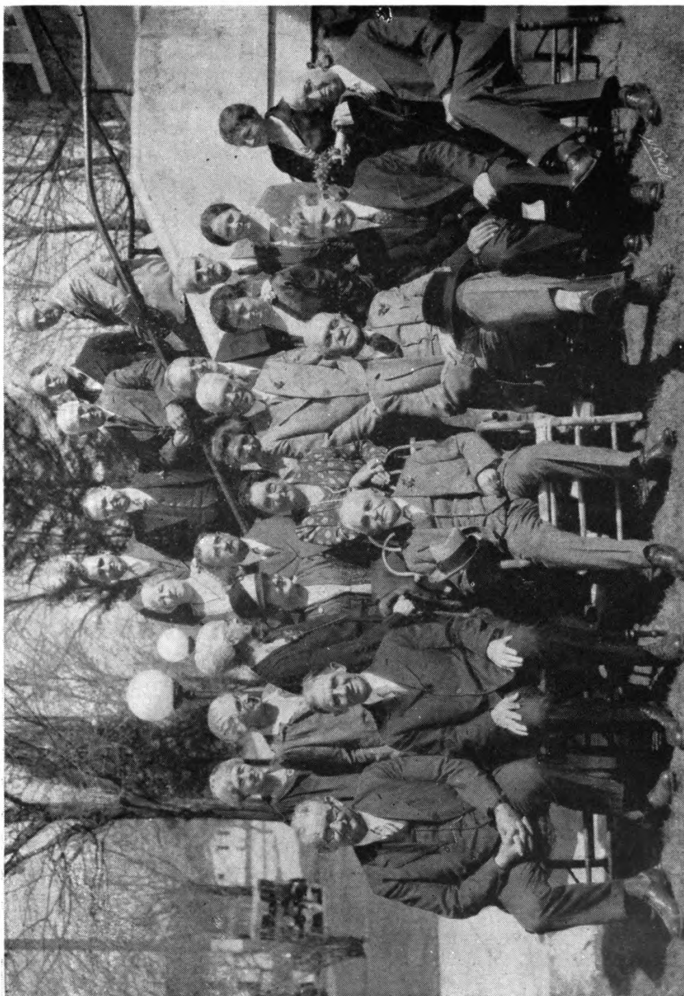
The Annual Meeting, May 2, 1928